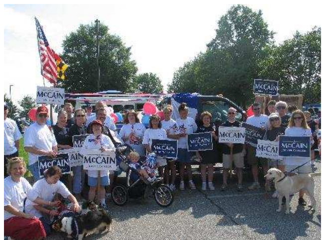
John McCain supporters at the River Hill 4th of July Parade. The McCain supporters overwhelmed the Democrats with our float, signs, and four legged McCain supporters.