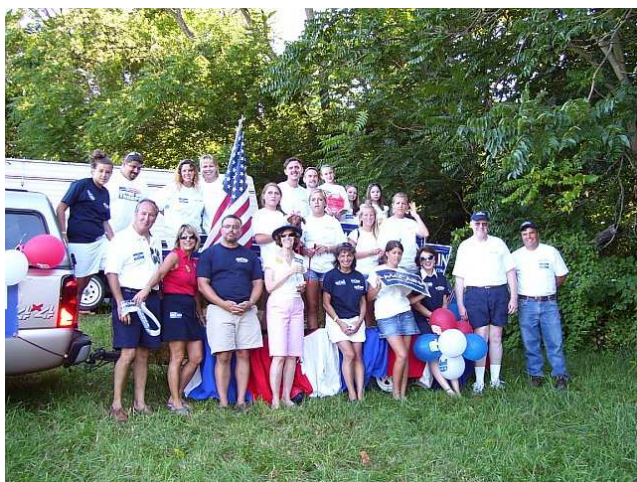
John McCain supporters at the Howard County Fair. The John McCain campaign was a huge hit at the fair, yard signs and bumper stickers were being passed out as fast as they came in.

On Thursday John McCain too gave an excellent and thoughtful acceptance