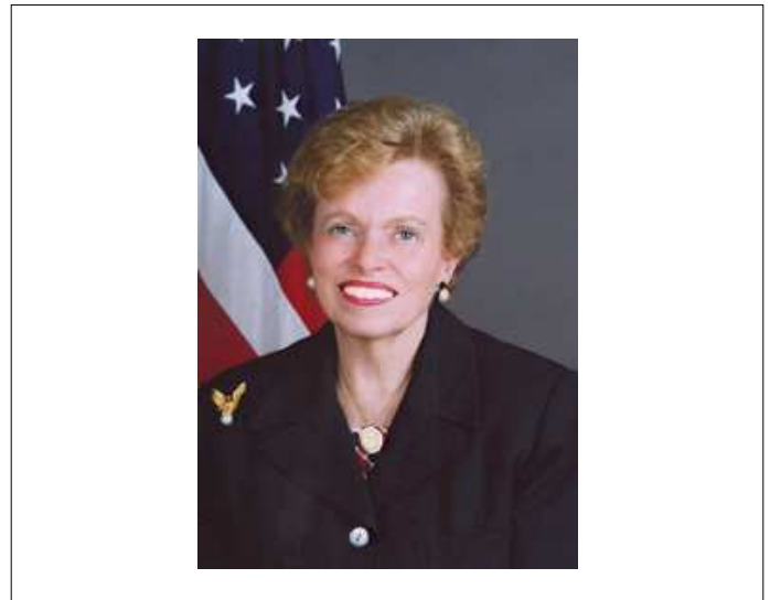
Former Assistant Secretary of State Ellen Sauerbrey

You can join Ellen Sauerbrey at the VIP Reception from 5:30 to 6:30 p.m. The main Reception starts at 6:00 p.m. and Dinner will begin at 7:00 p.m. followed by Ellen's speech and the Presentation of Awards. The Third Annual Silent Auction promises a wonderful collection of Re-