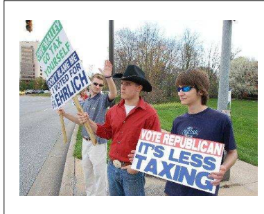
Howard County TARs sign waving during TaxInUs Maximus

More recently the Howard County TARs attended Howard County Republican Club, "Taxing Us Maximus" rally in Columbia, to show their disapproval of the O'Malley budget plan. Along side other Howard County Republicans, the TARs sign waved for two hours to help inform the public of the realities of the O'Malley budget crisis. In the near future the Howard County TARs will be attending the Howard County Lincoln - Reagan Day Dinner and also the TARs will be sending a delegation to the state party convention on May 9th in Annapolis where they will be co-sponsoring a McCain Hos-